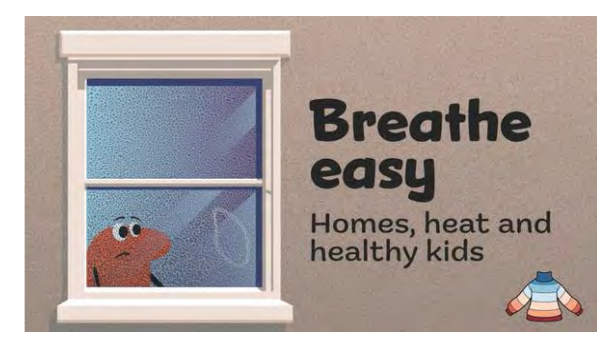
Figure 2: Animation, codesigned with The Parent Group.

The Parent Group have been working with Media Education to gain recognised qualifications for the work they have done. They have already attained a SCQF Level 3 qualification (Access to Media) and are working towards SCQF Level 5 Community Leadership qualification.