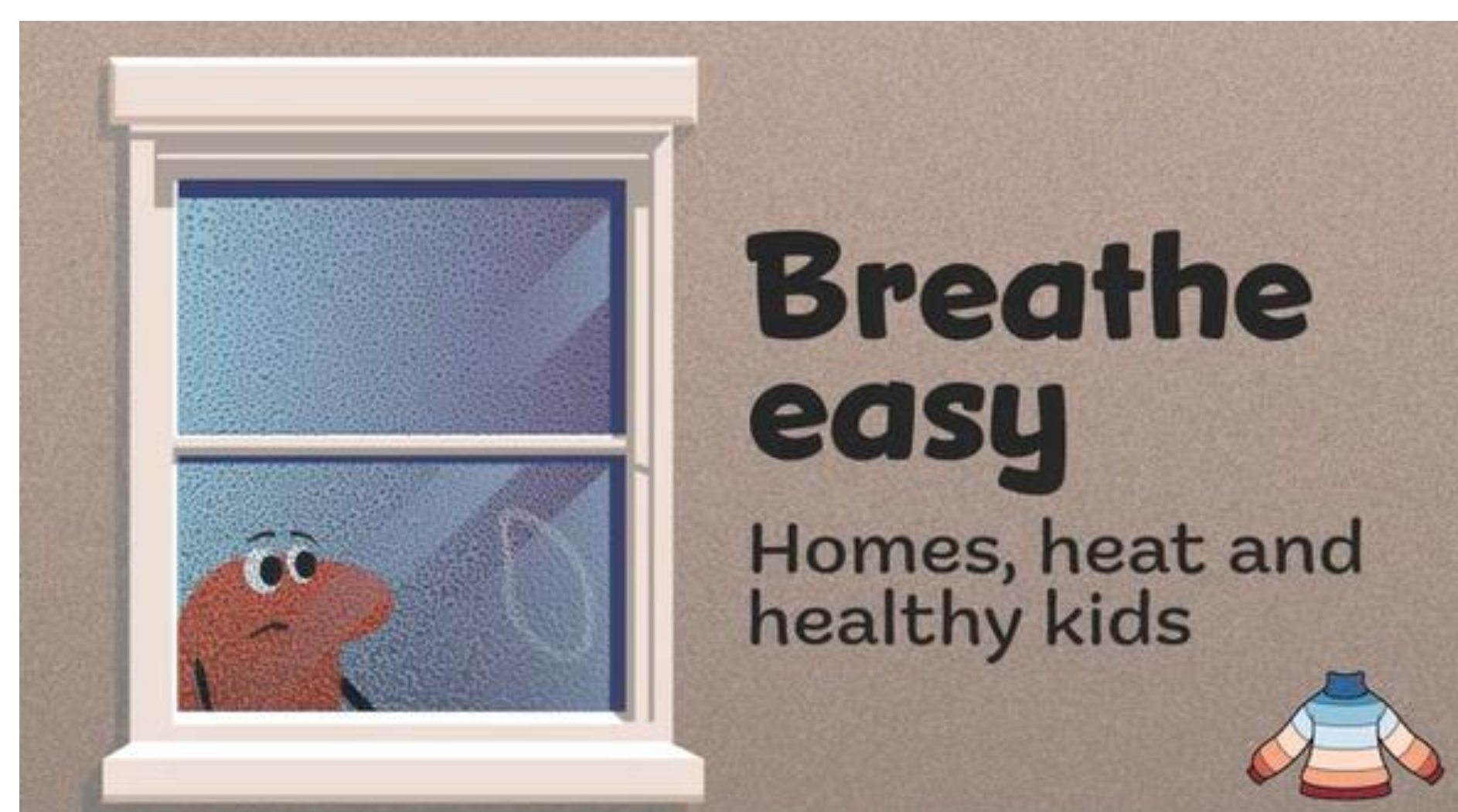
Figure 2: Animation, codesigned with The Parent Group.

The Parent Group have been working with Media Education to gain recognised qualifications for the work they have done. They have already attained a SCQF Level 3 qualification (Access to Media) and are working towards SCQF Level 5 Community Leadership qualification.